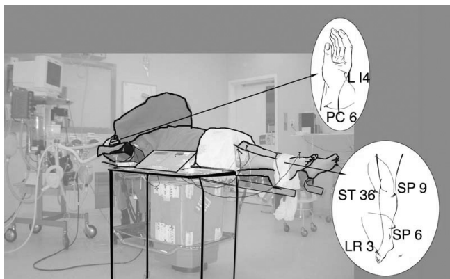
Fig. 2. Set-up with an acupuncture patient in the operating room. Acupuncture points are shown in circles. Electrodes were positioned accordingly in the sham patients.

After induction of anaesthesia by facemask with 6–8% of sevoflurane in 6 l min -1 of oxygen, EA