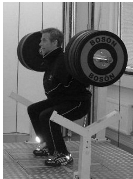
Figure 2 Squat training in the Bromsman device (group I). Informed consent was obtained for publication of this figure.

Considering the risk of worsening the tendon injury, by significantly adding eccentric load (group I) to an abnormal tendon, the safety of the rehabilitation protocols were followed by recording any side effects (numbers of interrupted training session because of pain, suspicions of worsening the tendinopathy, back or hip pain and head ache).