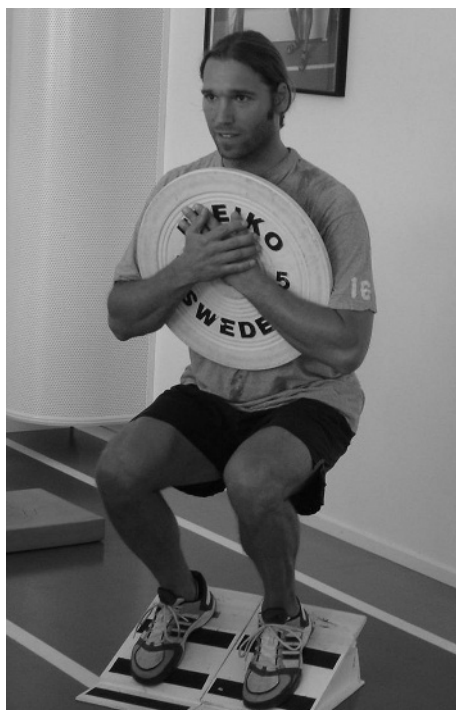
Figure 3 One-legged squat training on a decline board (group II). Informed consent was obtained for publication of this figure.