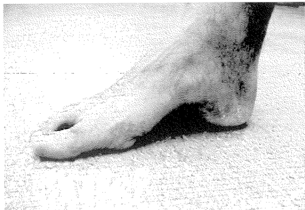
Figure 1. Photograph of the typical cavus foot featuring an excessively high medial longitudinal arch and clawing of the digits.

such as these are thought to be associated with abnormal pressure loading on the plantar surface of the foot. 3