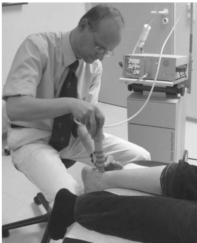
Figure 2. Application of shock-wave treatment.

sport, he or she automatically loses at least 10, and possibly 20, points.