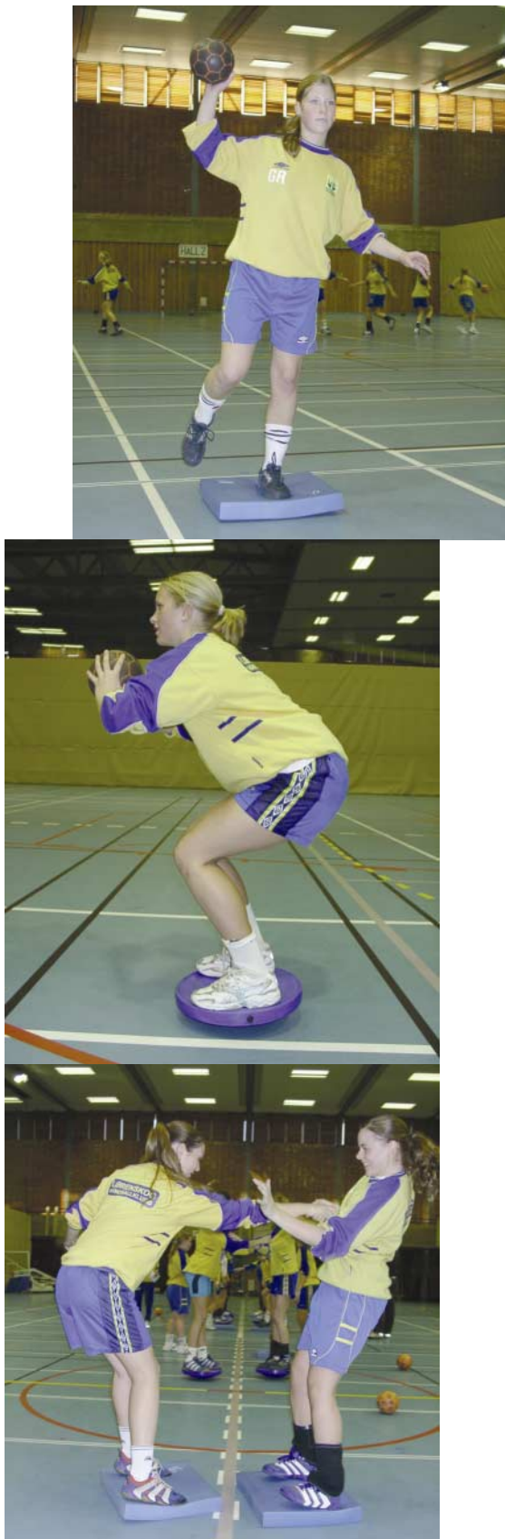
Fig 1 Top: mat exercise. Middle: wobble board exercise. Bottom: mat pair exercise