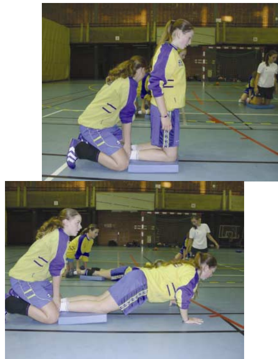
Fig 2 Example of a strength exercise ("Nordic hamstring lowers"). Top: start position; a partner holds around the player's ankles. Bottom: The player falls slowly forwards, using hamstrings to resist the fall against the floor as long as possible

relative risk of the number of injured players according to the intention to treat principle to compare the risk of an injury in the intervention and control groups. Cox regression was our analysis tool for the primary outcome as well as the secondary outcomes, and we used the robust calculation method of the variance-covariance matrix, 16 taking into account the cluster randomisation. We tested rate ratios with Wald's test. We used one way analysis of variance to estimate the intraclass correlation coefficient to obtain estimates of the inflation factor for comparison with planned sample size. We used the inverse of the difference between percentages of injured players in the two groups to calculate the number needed to treat to save one injury. We calculated exposures to training and matches and incidence of injury as described in our earlier study.