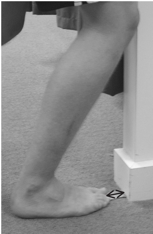
FIGURE 2. Weight-bearing dorsiflexion being measured with a tape measure.

The MWM_NWB was applied in supine, with the tibia resting on the treatment table and the ankle and foot unsupported off the edge of the table (Figure 4). The ankle was stabilized to the table by a nonelastic belt, while the therapist applied a sustained anteroposterior glide to the ankle. While the therapist maintained this glide, the patient was