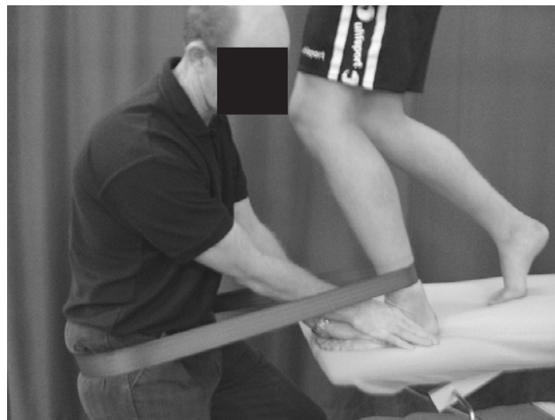
FIGURE 3. Weight-bearing mobilization with movement treatment. The belt applies a posteroanterior force to the distal tibia, while the talus and foot remain stationary on the table and the patient actively goes to end of pain-free range dorsiflexion.