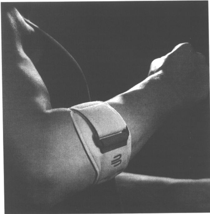
Figure 1. The brace that was used.

Patients in the brace group (group B) were provided with the brace immediately after randomization. The brace used was the Epipoint (Bauerfeind, Zeulenroda, Germany) (see Figure 1). Instructions on use and application were given immediately, using a standardized protocol. Patients were instructed to visit a physical therapist participating in the trial once during the first week of the intervention period, who, again, instructed the patient in the use of the brace according to the standardized protocol. No physical therapeutic treatment was applied in this 1 session. Patients were advised to wear the brace continuously during daytime for the 6-week intervention period. Activities causing pain despite the use of the brace were discouraged.