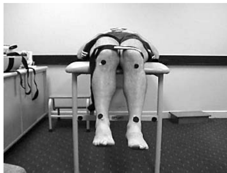
Figure 2 Resting position for the measurement of hip internal rotation.

change in SLR of 15° and visual analogue scale (VAS) of 2 cm, based on clinical experience, as no published data were available. Subjects completed a screening questionnaire and had a physical examination. Those accepted into the study had a gradual onset of hamstring pain, reproduction of recognisable hamstring pain with pressure on their gluteal trigger points, a good understanding of written and spoken English, and were able to attend all sessions.