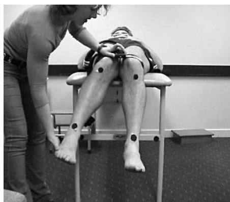
Figure 3 Measurement of hip internal rotation. The remote control is held by the examiner's left hand and the hip is passively internally rotated. The technique is reversed for analysis of the left leg.

Testing was delayed for an intercurrent illness or injury that prevented completion of the running task, or if the MRI scan exhibited extremely mild non-localised hamstring oedema. This is an extremely mild strain injury and correlates with full strength and symptom free return to sport within 7–14 days. 44 Subjects describing long term hamstring pain, but exhibiting mild oedematous changes on MRI consistent with a mild new injury, were reassessed at one to two weeks and were only included if their hamstring was not tender and if they had full resisted strength on manual testing and continued to complain of symptoms consistent with those of the long term complaint. It was essential that their symptoms be reproducible with gluteal trigger point pressure. Table 1