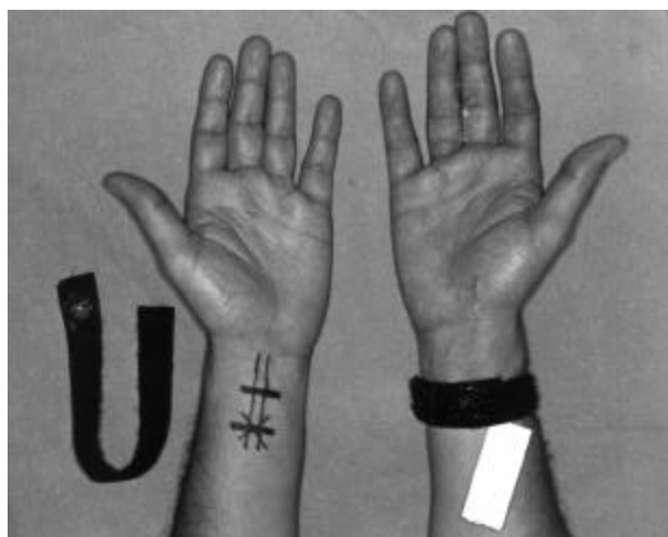
FIGURE 1 Location of pericardium 6 (P6) meridian point and the proper application of acupressure wristband; which is an adjustable velcro strap, 3/4 inch in width, with a spherical plastic bead attached to it.

Acupuncture and acupressure are based on the belief that an individual's well being depends on the balance of energy in the body as well as the overall energy level. It is hypothesized that energy flows in the body along paths referred as meridians and that these techniques restore the balance of energy by manipulating these meridians. 7 P6 ( Nei-Guan), a Chinese meridian point, is specifically designated for the treatment of nausea and vomiting. P6 is located on the anterior surface of the forearm, approximately 1 cm deep to the skin, two (body) inches proximal to the distal crease of the wrist joint between the tendons of flexor-carpi-radialis and palmaris longus. A body inch is equal to the width of the interphalangeal joint of the patient's thumb.