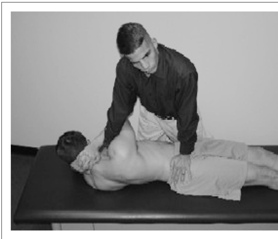
Figure 1. Manipulative intervention used in developing and validating the spinal manipulation clinical prediction rule.