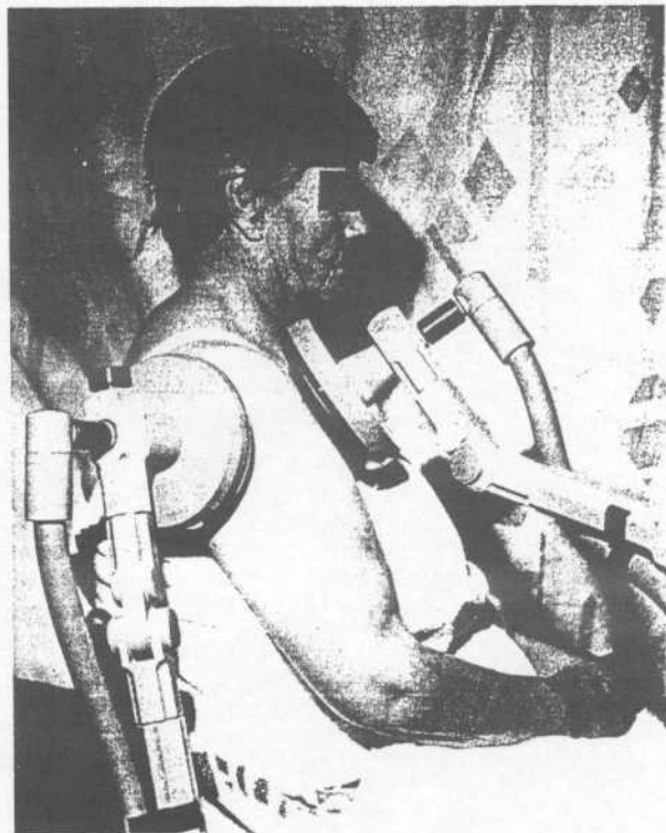
Figure 1. Positioning of the electrodes and patient during electrotherapy.

Assessments were carried out at 1, 2 and 6 months, later assessment being unnecessary (Young and Wallace, 1985). Assessments of pain at rest and on movement were made on a five-point scale; analgesia requirements were also noted. Muscle wasting and strength were assessed by comparison with the uninjured shoulder. The combined range of