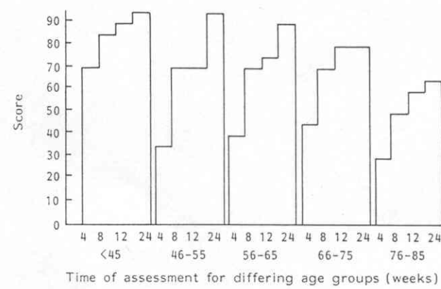
Figure 4. Mean functional scores (AFI) given by age.