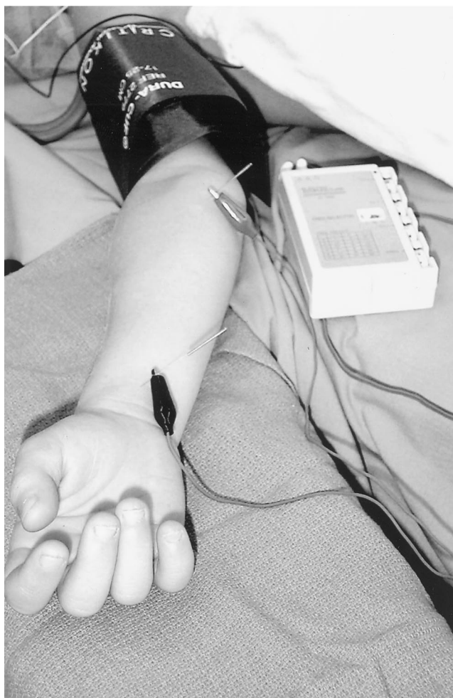
Fig. 1. P6 Acu treatment on the forearm of a patient.

Anesthetic and surgical techniques were standardized. Solid food was held for at least 8 h before surgery, and clear liquids were permitted up until 2 h before surgery for all groups. All patients received oral midazolam (0.5 mg/kg to a maximum of 10 mg) 20 min before induction of anesthesia with halothane or sevoflurane in oxygen (30%) and nitrous oxide (70%) via mask. After intravenous cannulation, 0.2 mg/kg mivacurium, 0.1 mg/kg morphine sulfate, and at least 20 ml/kg lactated Ringer's solution were administered. Anesthesia was maintained with oxygen, 70% nitrous oxide, and isoflurane via an endotracheal tube. Ventilation was controlled at a peak inspiratory pressure of 25–30 cm H 2 O to maintain an end-tidal carbon dioxide tension of 35–40 mmHg, until spontaneous return of neuromuscular function. Awake tracheal extubation was performed after orogastric suction. Postoperative pain was treated with 0.05 mg/kg morphine, repeated as needed. Lactated Ringer's solution was infused at a maintenance rate until oral clear liquids were accepted without vomiting. Thereafter, oral analgesics were administered as needed every 3 h (acetaminophen with codeine, 1 mg/kg). Surgical techniques were standardized, and dexamethasone was not administered. Details of treatment in three groups follow. All active, sham, and control treatments were performed by the same acupuncturist (LR).